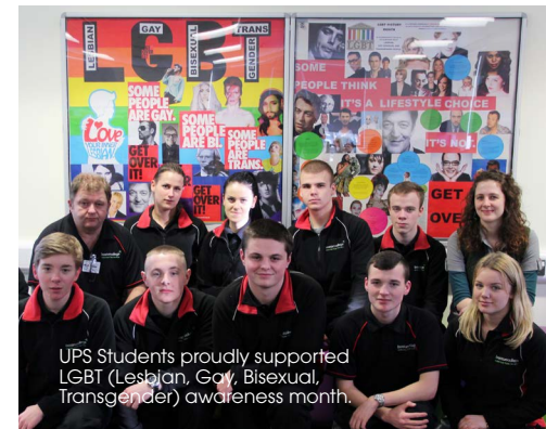
UPS Students proudly supported LGBT (Lesbian, Gay, Bisexual, Transgender) awareness month.

Underpinning this statement are our employer, student and visitor policies and procedures. Each give consideration to equality, diversity and inclusion and are routinely analysed and monitored to ensure they achieve the desired impacts and outcomes.