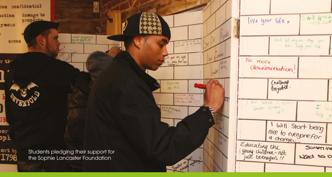
Students pledging their support for the Sophie Lancaster Foundation

Advancing equality, diversity and inclusion so that it is central to our college culture will help fulfil our vision and mission: